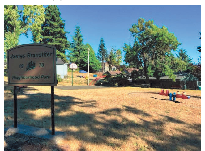
Branstiter Park - 690 SE 6th Street