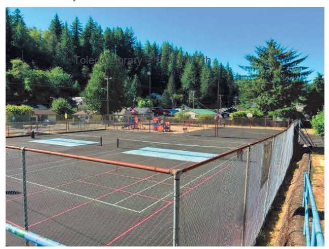
Arcadia Park - 840 NW A Street