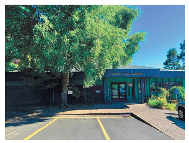
Toledo Library - 173 NW 7th