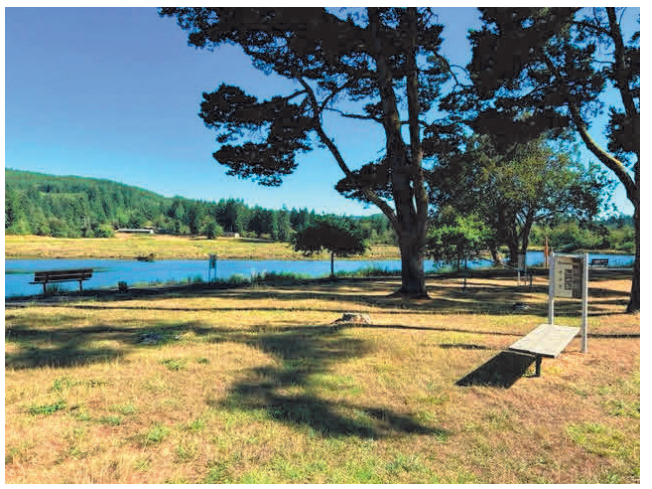
East Slope Park – 936 SE 10<sup>th</sup> Street