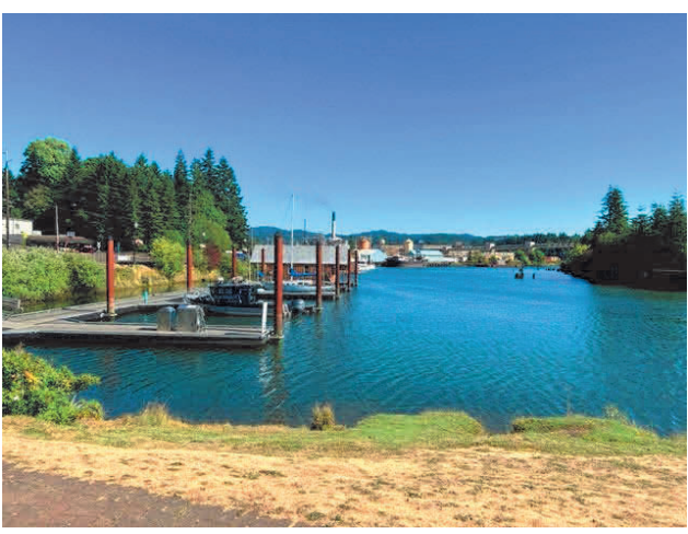
Port of Toledo Waterfront Park – 127 NW A Street