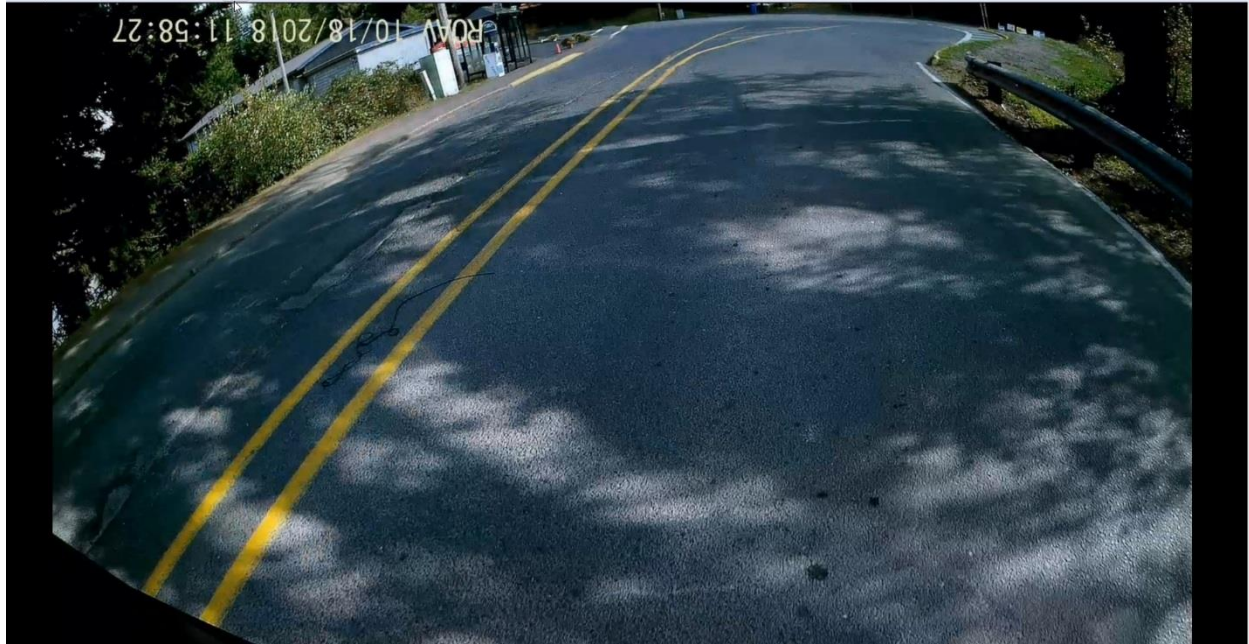
Figure 9: SE 10th Street, approximate Mile Point 0.50-0.54