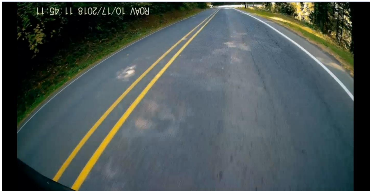
Figure 1: Business Highway 20, approximate Mile Point 6.24