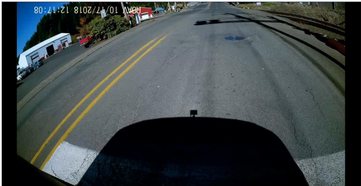
Figure 4: NW A Street, approximate Mile Point 0.01-0.07