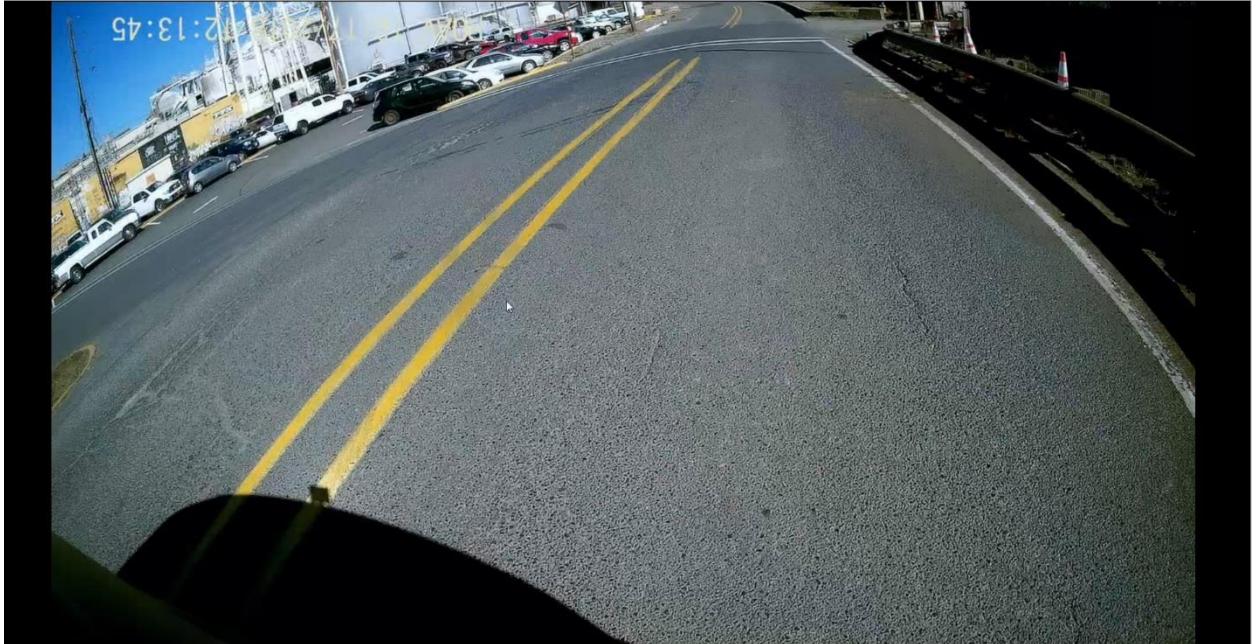
Figure 7: SE Butler Bridge Road, approximate Mile Point 1.11