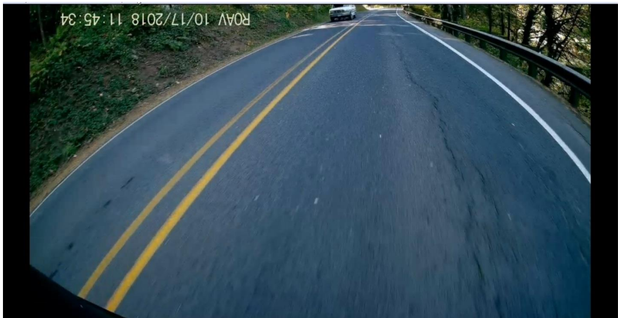
Figure 2: Business Highway 20, approximate Mile Point 6.27