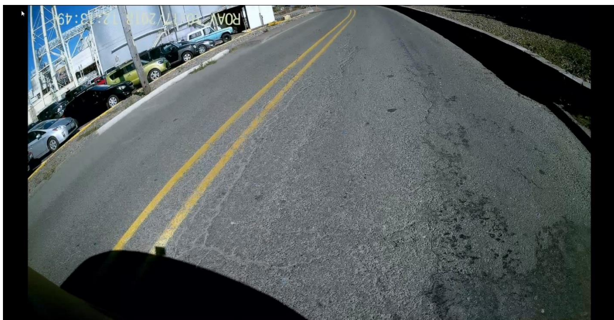
Figure 6: SE Butler Bridge Road, approximate Mile Point 0.96-1.11