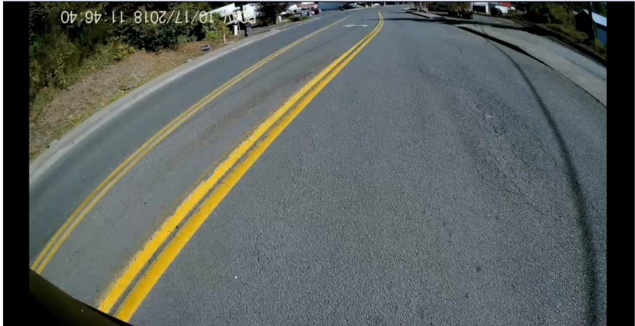
Figure 3: Business Highway 20, approximate Mile Point 6.64